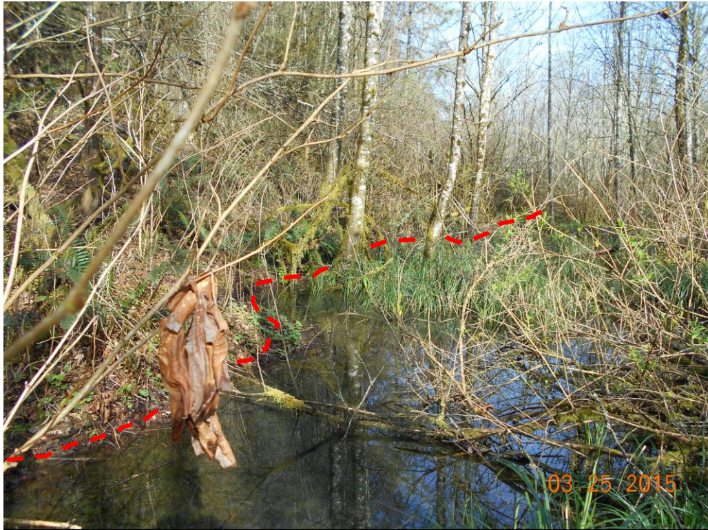
View north showing OHWM (dashed line) and typical area of shallow ponding considered critical habitat for OSF near toe of slope approximately 175 feet west of active channel.

As noted in our August 2015 assessment: “The distance between the top of bank of the active channel to the toe of slope averages approximately 175 feet. The left bank exhibits recent active erosion and indications of periodic overbank flooding west to the toe of slope. Surface hydrology was observed in saturated soils mapped as hydric Samish silt loam (Soil Survey, 1989) and discrete areas of shallow ponding to the toe of slope.”